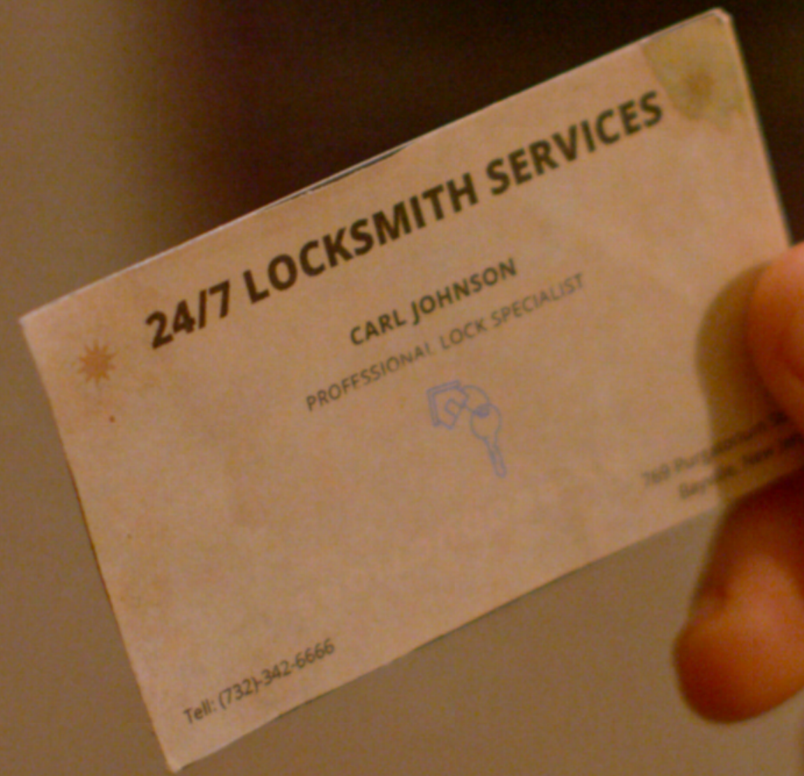
Still from The Keys