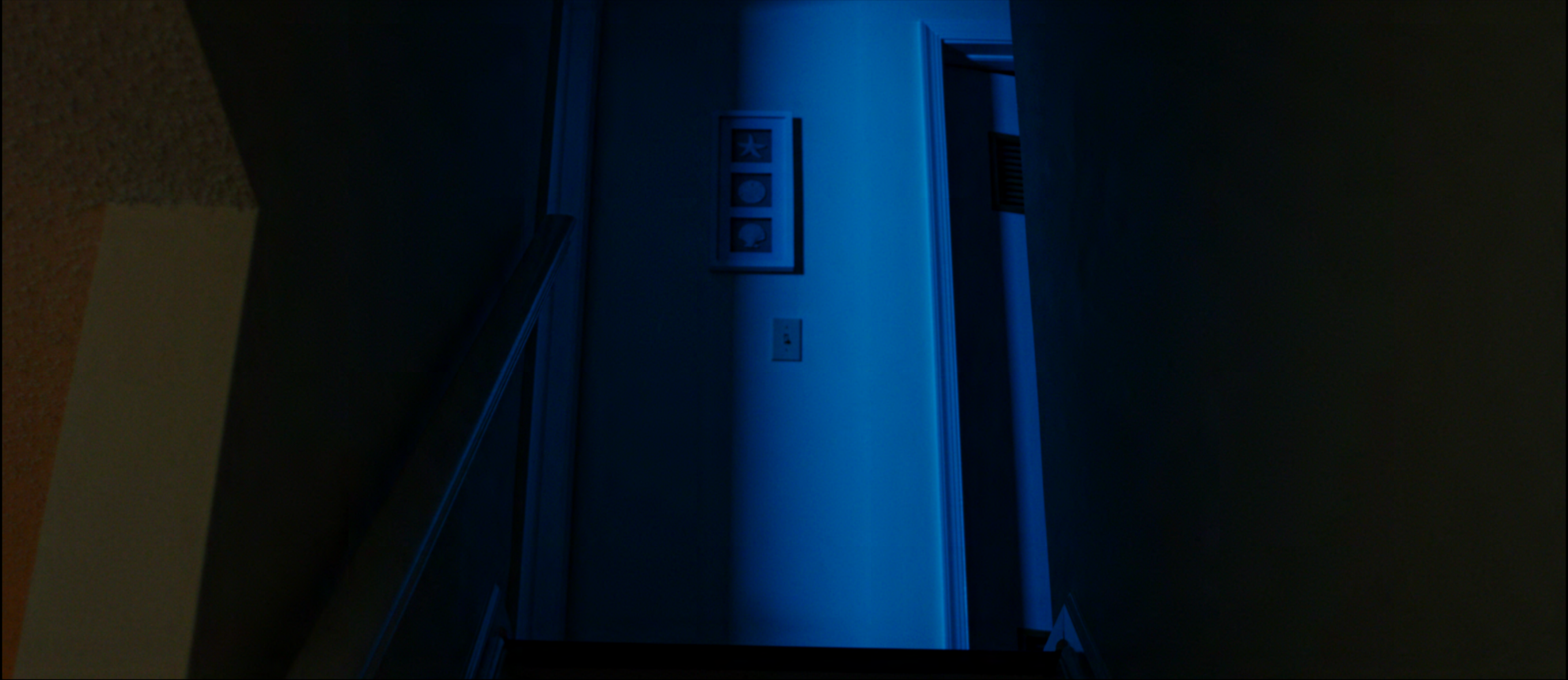
Still from The Keys