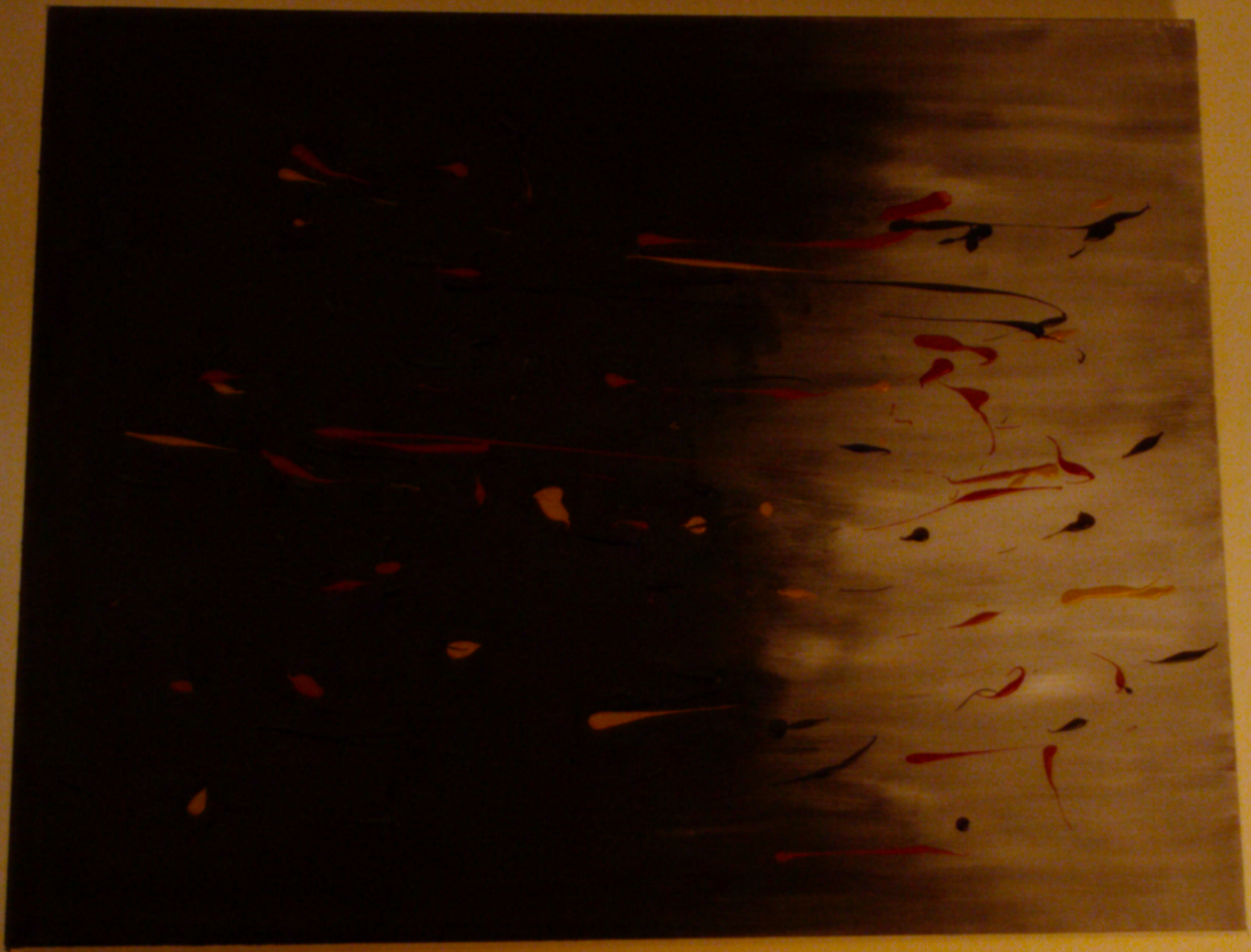
Still from The Keys