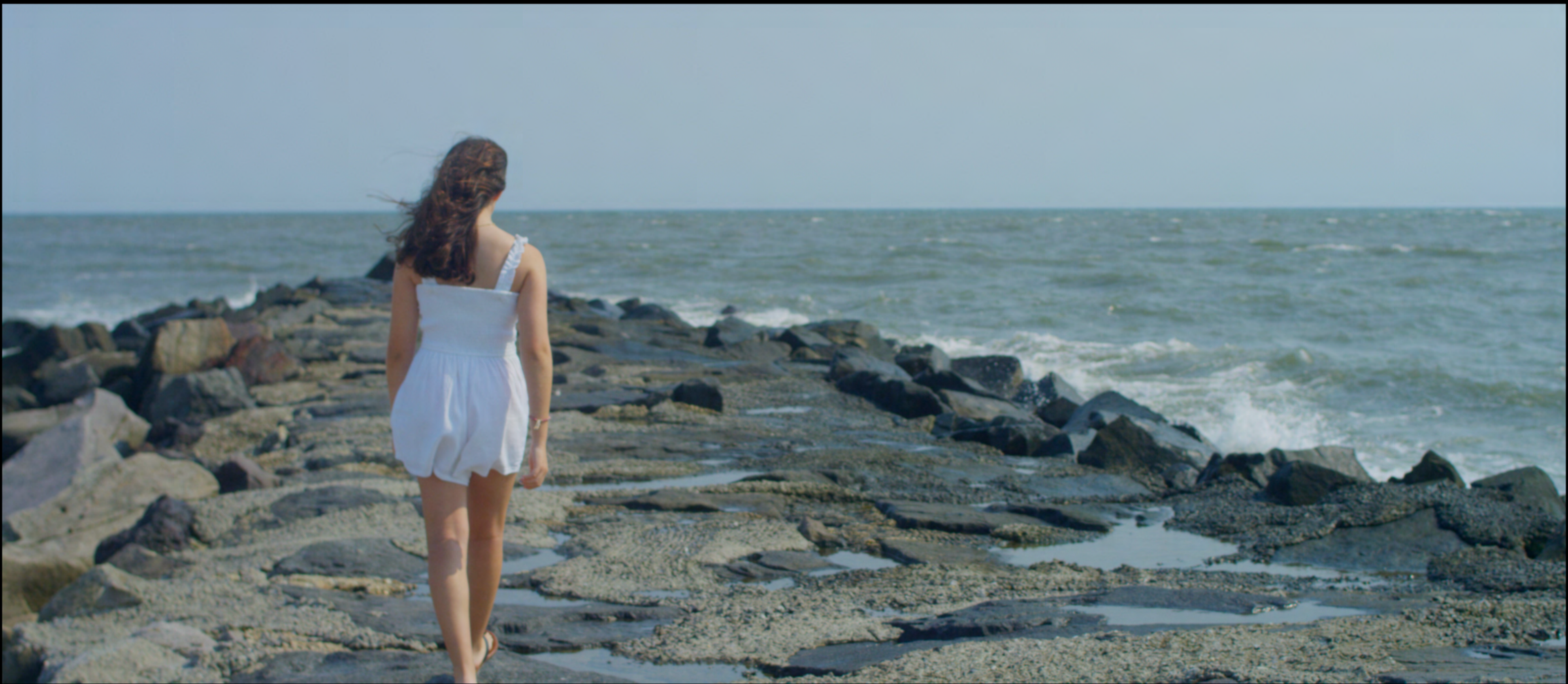
Still from The Keys