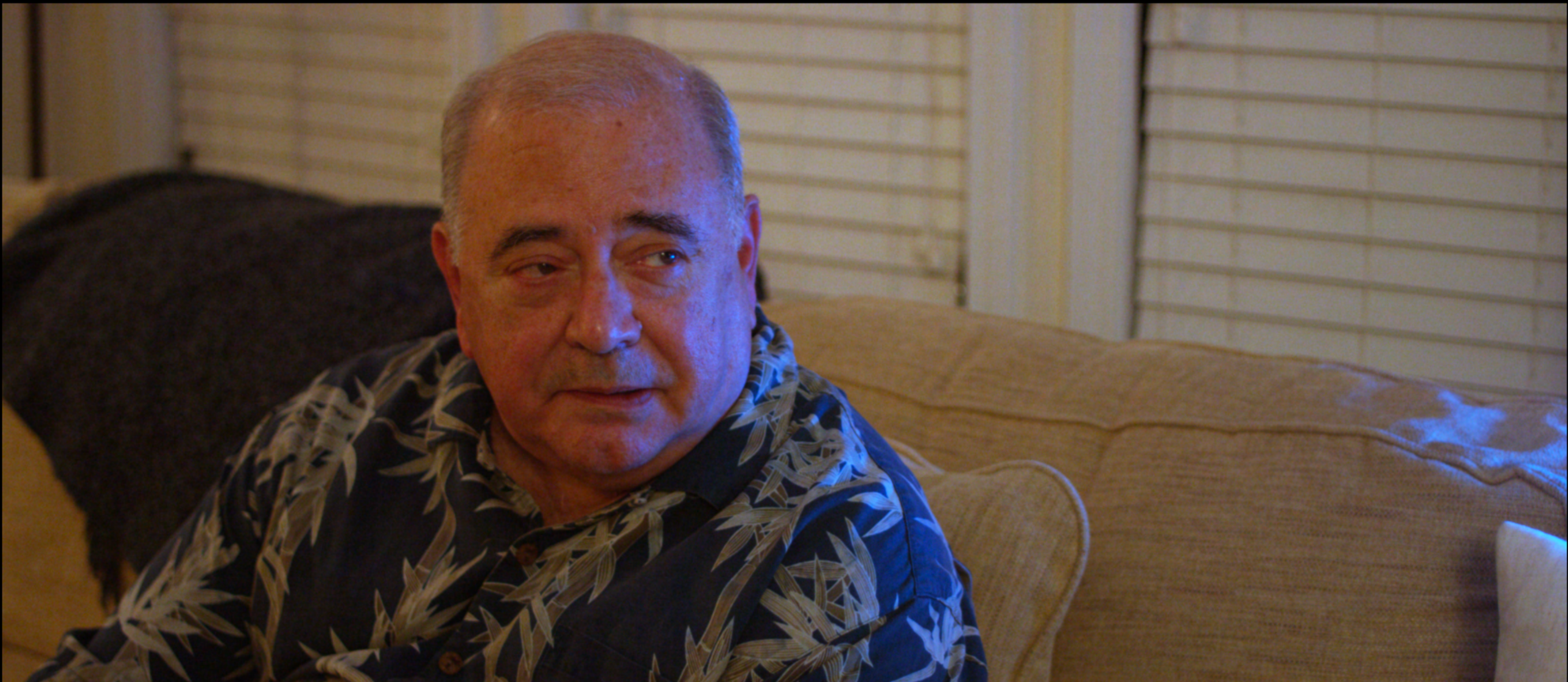
Still from The Keys