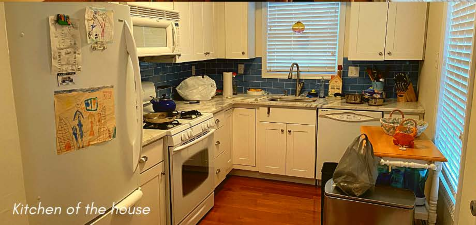
Kitchen of the house