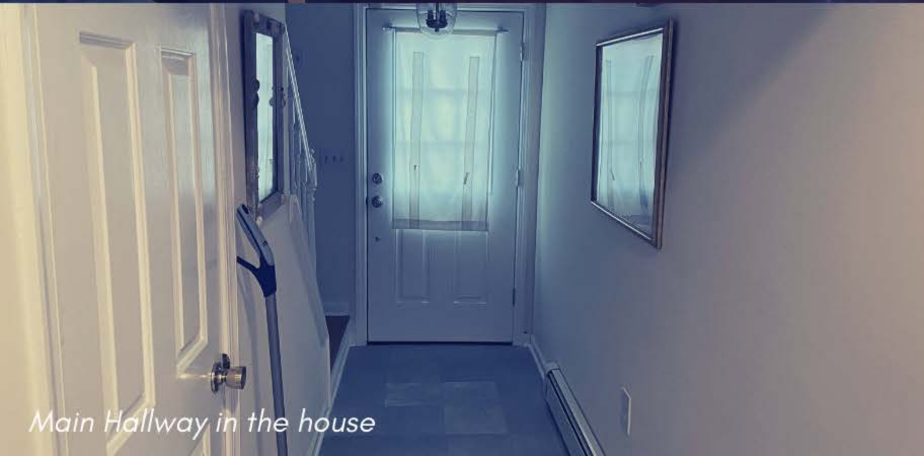
Main Hallway in the house