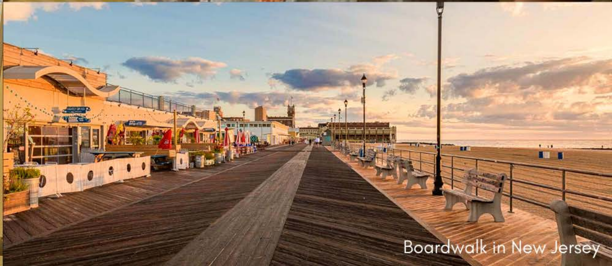
Boardwalk in New Jersey