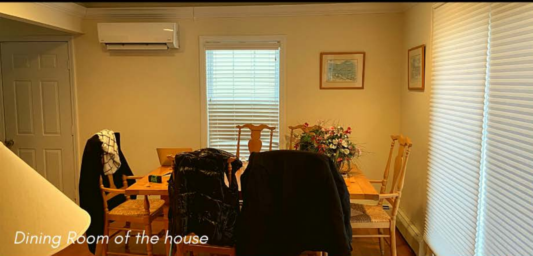
Dining Room of the house

COLORS: Real, Warm, Earth, Bold INSPIRATION: Barton Fink