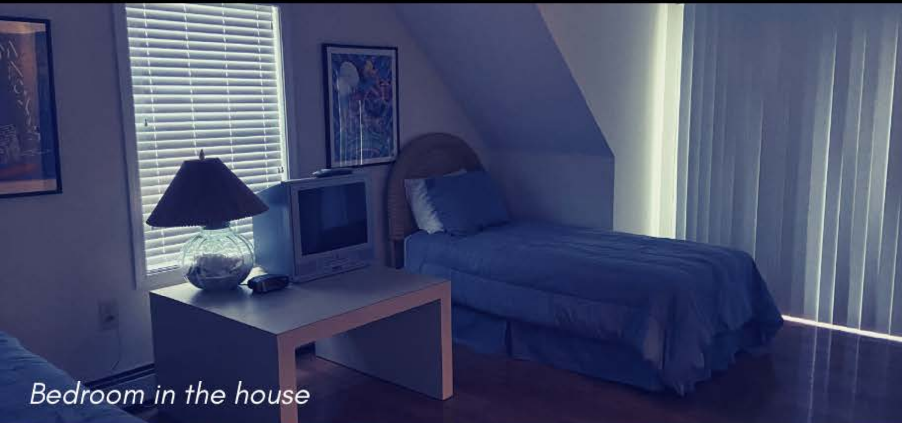
Bedroom in the house

COLORS: Cold, Isolated, Bleak INSPIRATION: The Shining